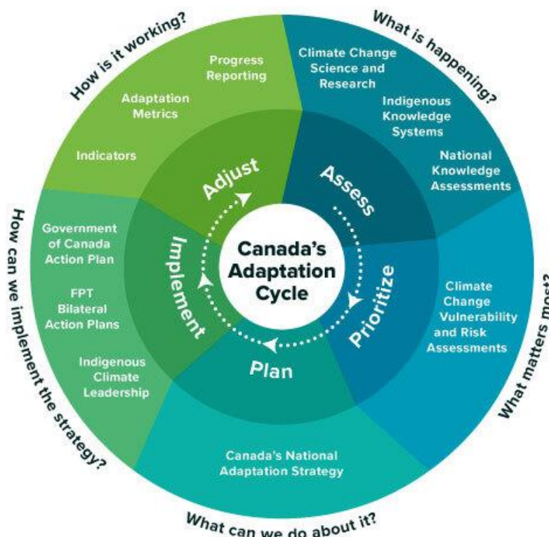
Figure 2. Graphic showcasing Canada's adaptation cycle and where the GOCAAP and NAS fit within this process.

Additionally, the GOCAAP will be updated if necessary to reflect the final contents of the National Adaptation Strategy.