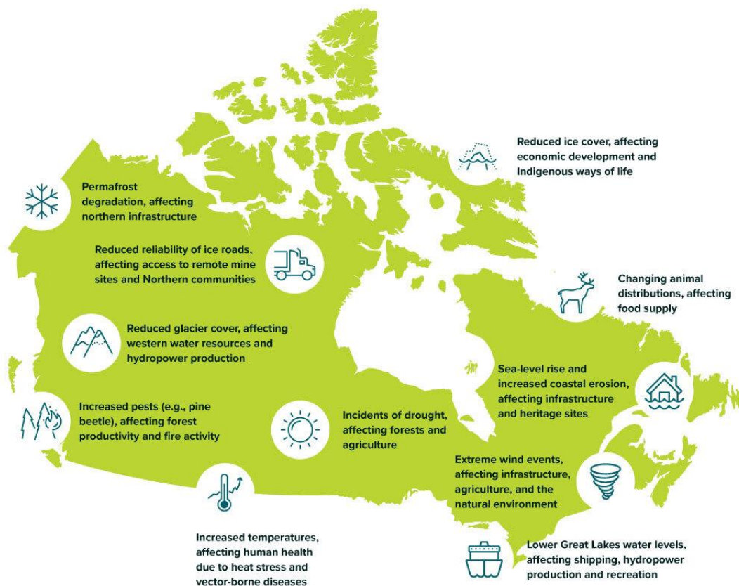
Figure 3. Some of the many regional climate change impacts that people in Canada are facing. 1

However, the impacts of climate change are not limited to severe weather. Climate change poses both immediate and long-term risks to nearly every component of Canadian society. Slow-onset changes, while more difficult to see in everyday life, are projected to have impacts and costs of a similar magnitude to extreme weather events.