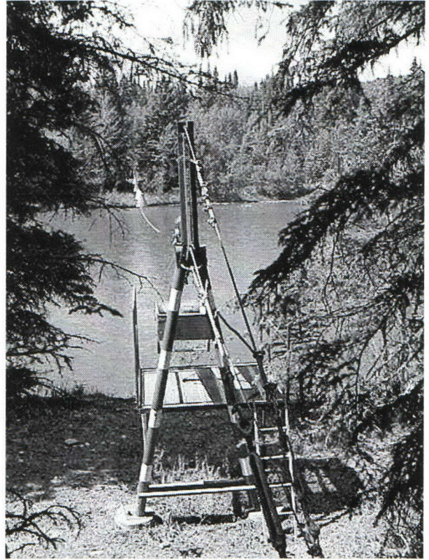
Figure 1: Berland River Cableway