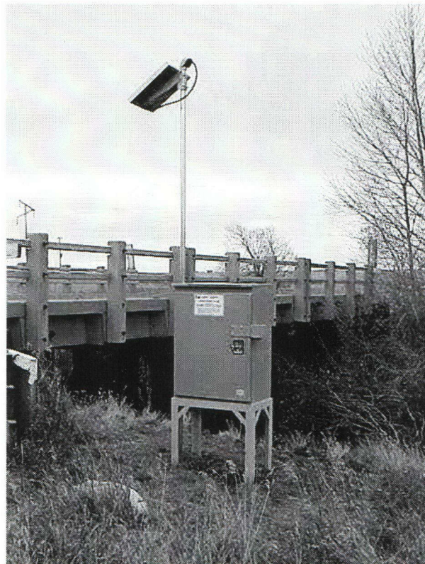
Figure 2: Kennedy Coulee Dessert Box