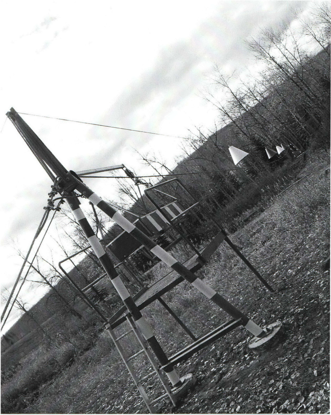
Figure 1: Clear River Bear Canyon Cableway