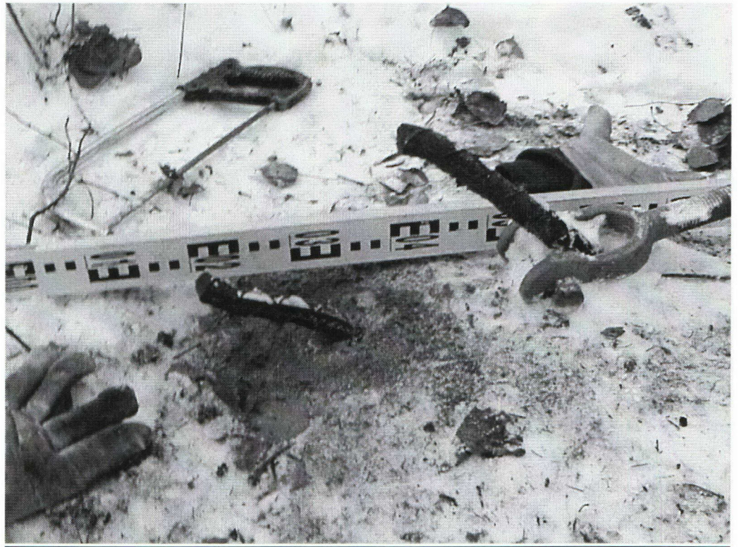
Figure 2: Waskahigan anchor failure