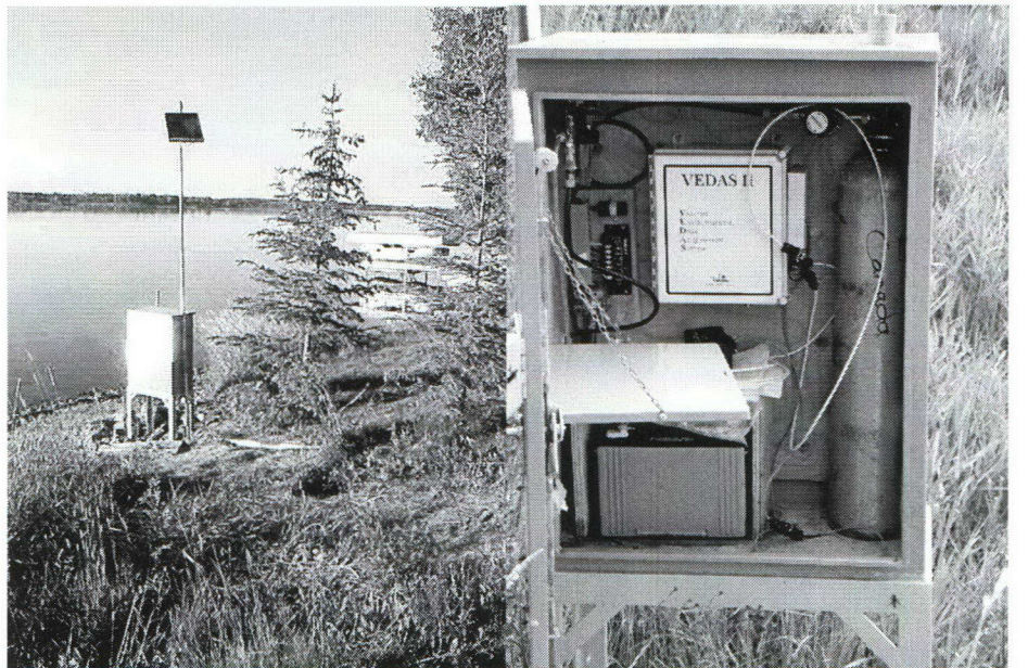
Figure 5: Isle Lake Manual gauge upgrade