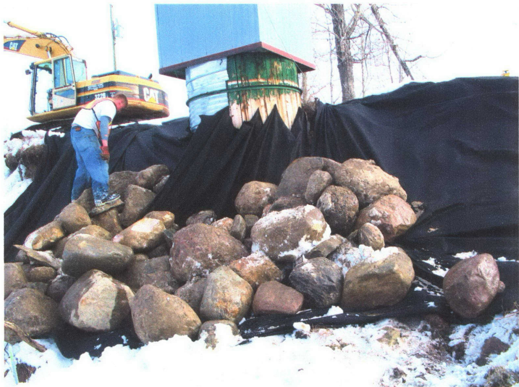
Figure 3: Blindman Blackfaulds - 05CC001