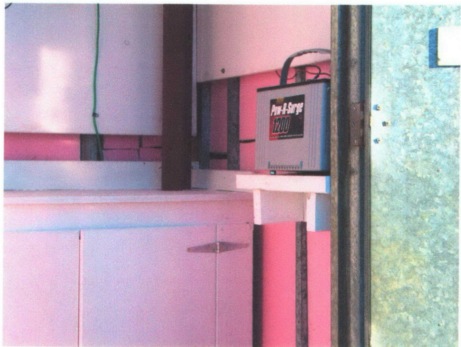
Figure 5: Shelter Upgrades