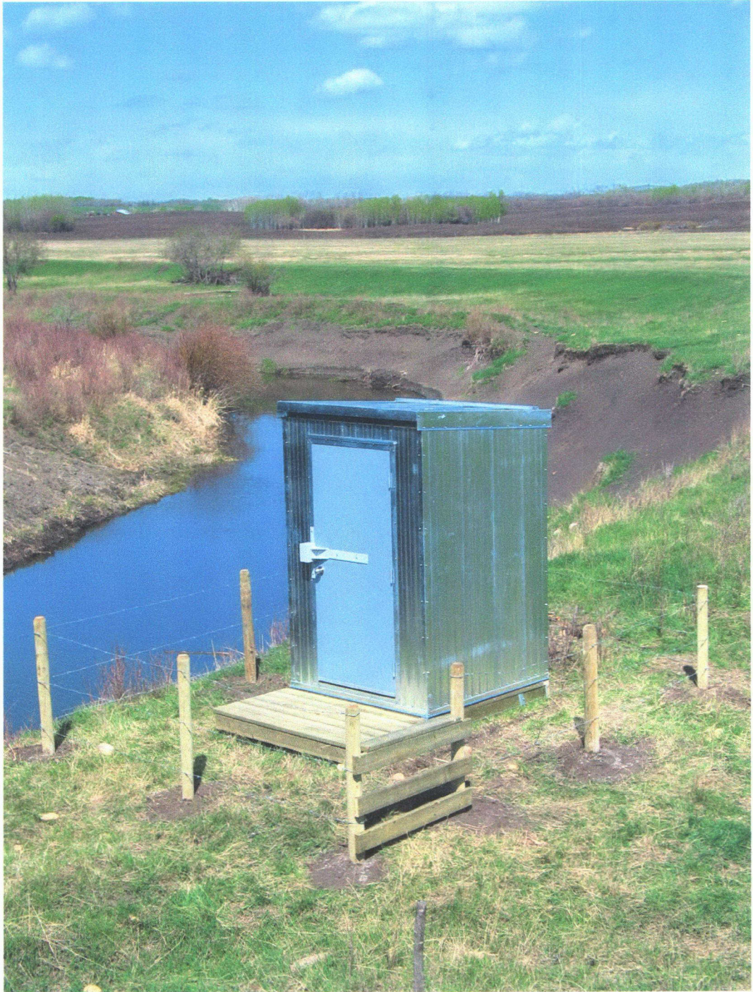
Figure 1: Little Paddle River Maverthorne - 07BB005