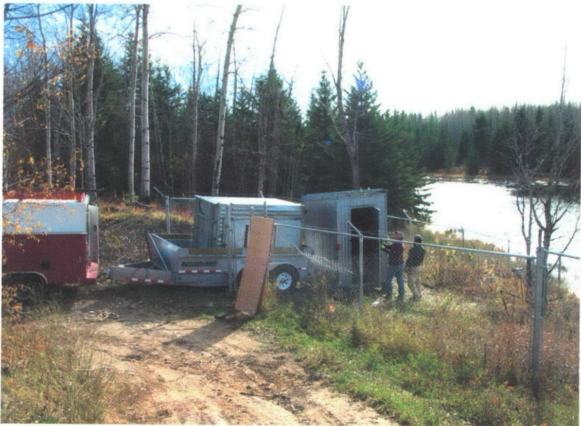
Figure 4: Cadotte River - 07HB001