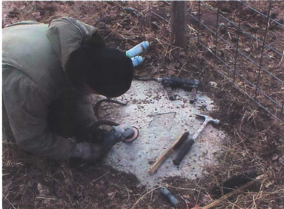
Figure 7: Magnetic Particle Inspections