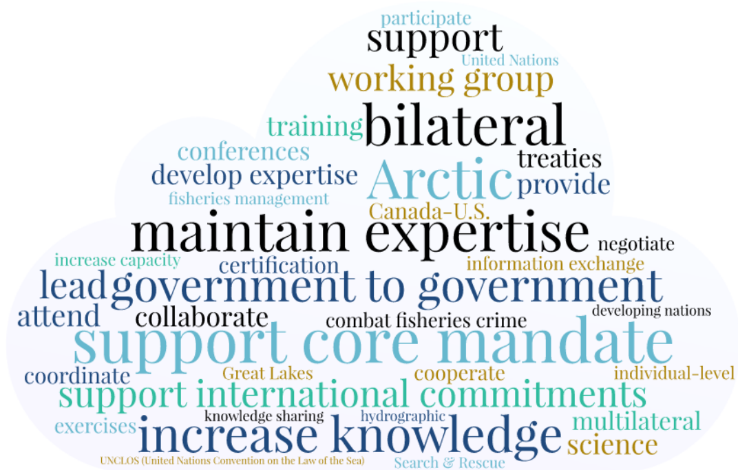
Figure 1: Word Cloud Survey of International Activities undertaken across DFO and CCG, 2016–2017

A thematic department-wide approach to reporting on international work would be particularly useful to highlight the work of DFO's science sector (EOS), which provides research advice and support to many other programs within the Department, and whose advice cannot always be directly ascribed to the programs that use it. For example, the evaluation learned that EOS has provided science advice to the IE Program that was not funded by IGS (and thus, not reported on through the IE Program): domestic science information in support of TIMAD and direct support from science representatives during international meetings, neither of which is funded by IGS. If