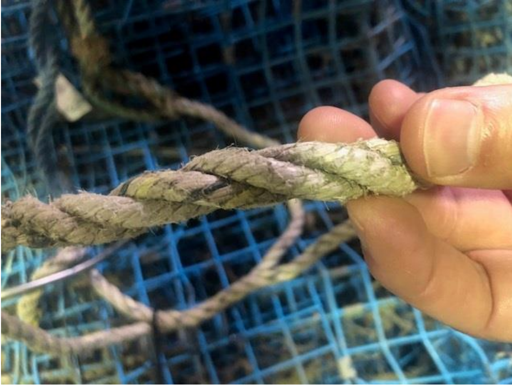
Fig. 3. Half-inch rope with yellow and black tracer on the same strand.