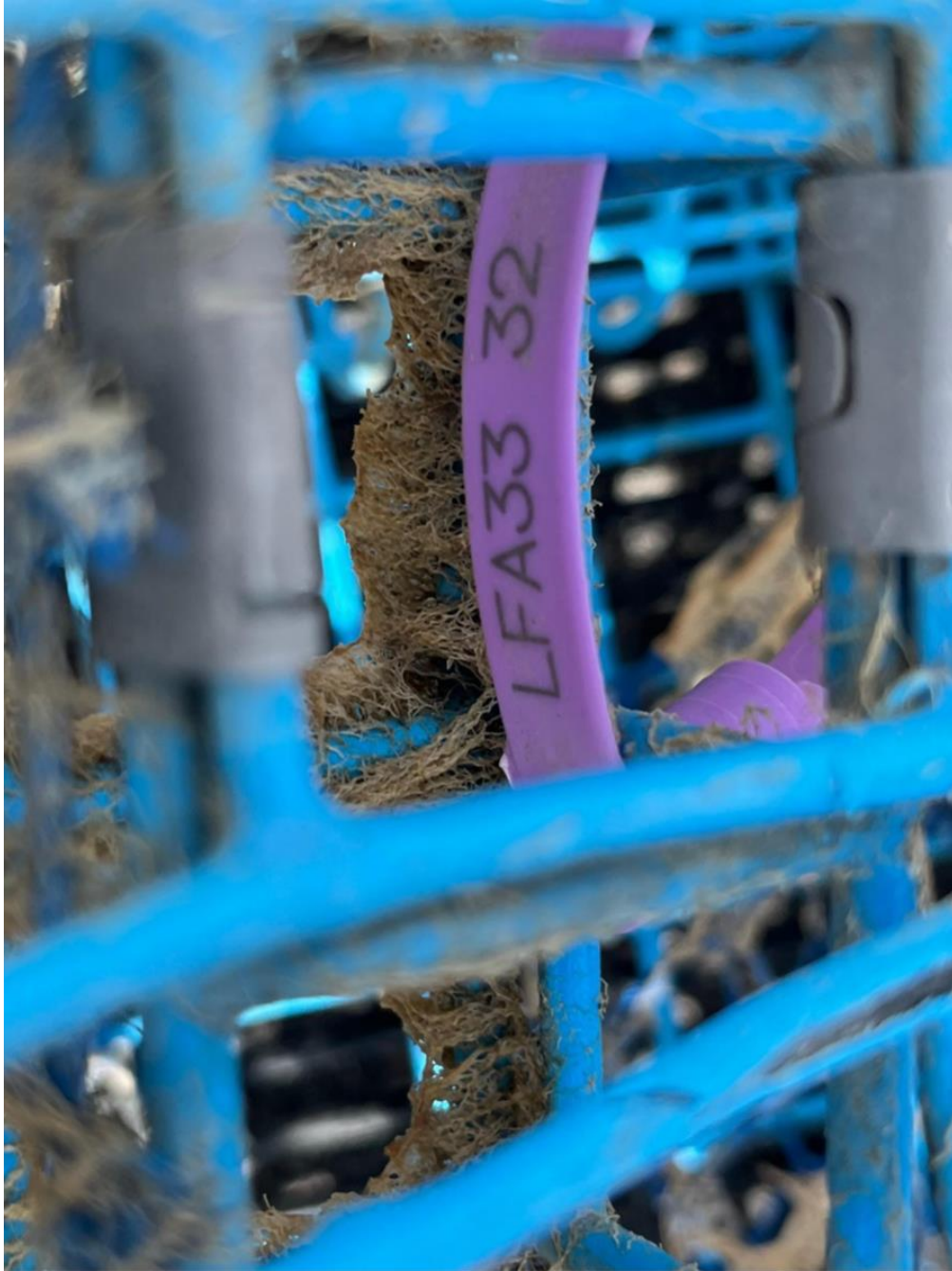
Fig. 2. LFA 33 purple coloured tags that were attached to the lobster traps recovered from Argo. The 32 is used to identify tag manufacturer and does not represent LFA 32.