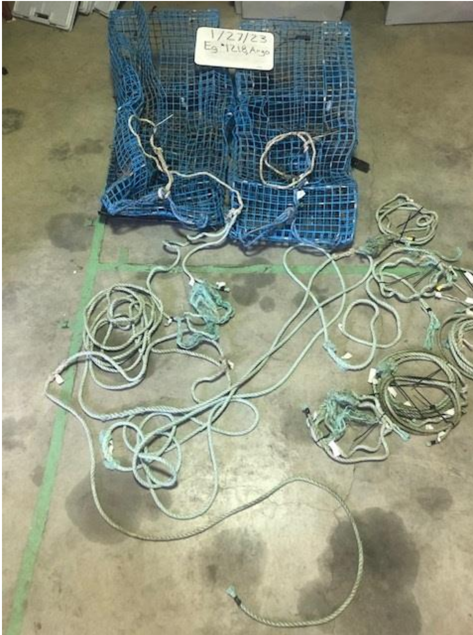
Fig. 1. Gear removed from Argo laid out in the NOAA Gear Warehouse in Narragansett, Rhode Island.