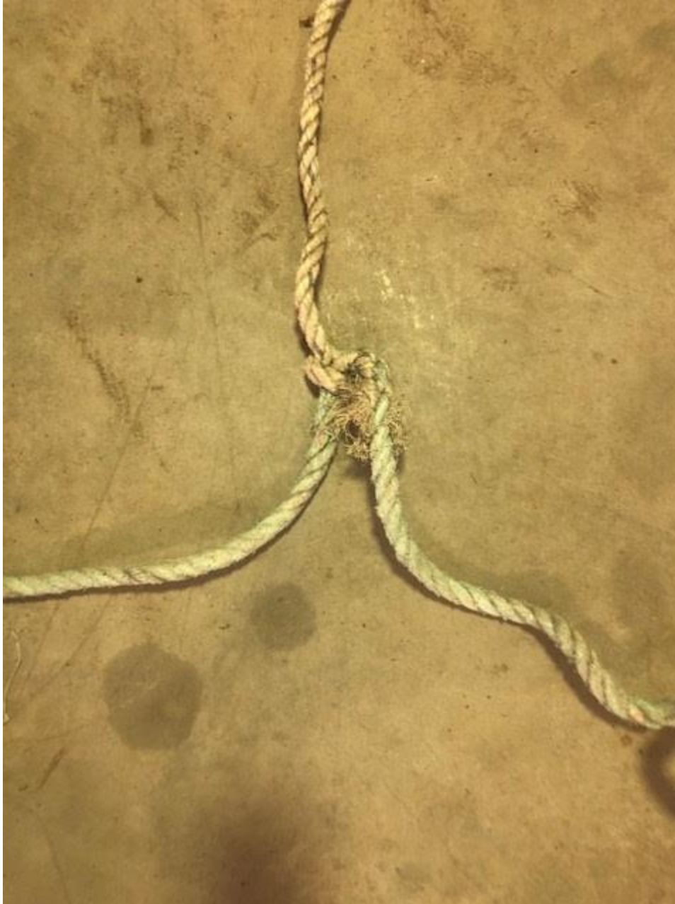
Fig. 4. A gangion attachment site to ground line on gear removed from Argo. The lower rope (ground line) has orange tracers and the upper rope (gangion) has yellow and black tracers.