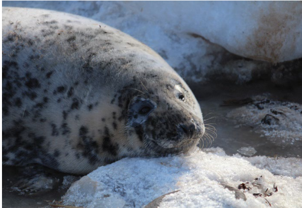
Grey seal beater (Photo credit: Shelley Lang).