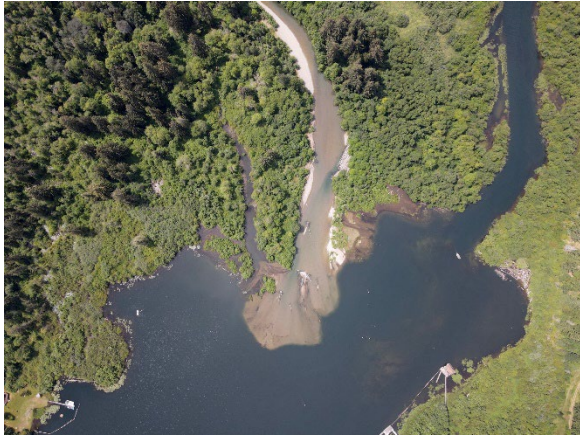
Figure 3. Downstream transport of sediment, impacting alluvial fan at Robertson River in 2022.

The aggradation of alluvial fans, stream flow and lake water levels are some of the site specific variables that can contribute to or limit the Vancouver Lamprey accessing and utilizing this habitat type during critical life stages (Figure 2). In Cowichan Lake, aggradation and low lake levels have resulted in alluvial fan habitat becoming dewatered prior to peak spawning periods within the spawning window. Removal of excess sediment could contribute to maintaining spawning habitat for Vancouver Lamprey, even with lower lake water levels. Therefore, for alluvial fans which have excess sediment that are at risk of being dewatered with low lake water levels during the spawning period, removal of excess sediment could be evaluated to determine the conservation benefits for Vancouver Lamprey. Creation of sediment traps could also be highly beneficial and provide some level of protection and stability to spawning habitat from continual aggradation.