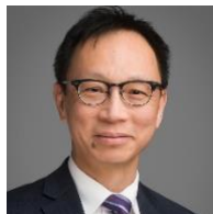
Yuen Pau Woo