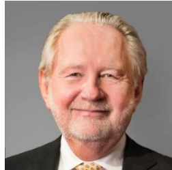
The Honourable Peter Harder, P.C. Deputy Chair