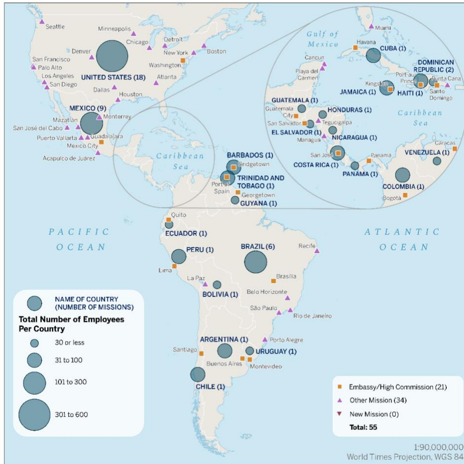
Map 2. Canada's Missions in the Americas and the Caribbean

Note: Canada's Embassy to Venezuela in Caracas has temporarily suspended operations.