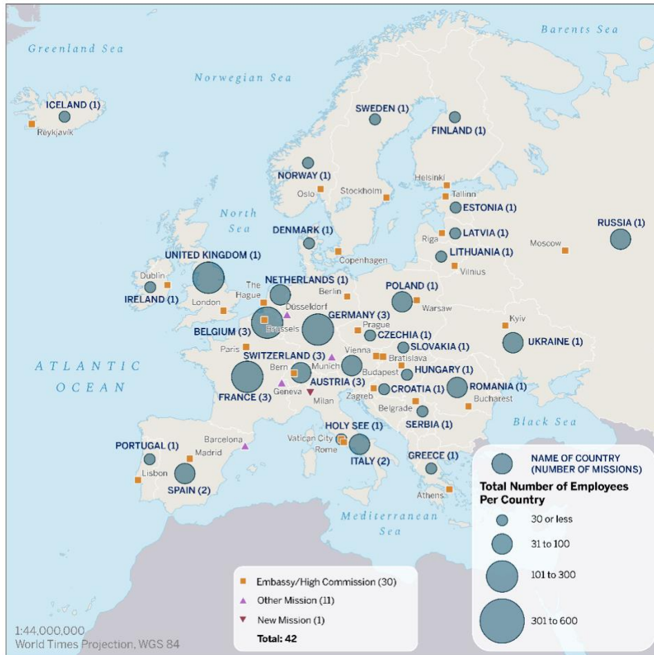
Map 4. Canada's Missions in Europe and Russia

Note: The number of missions includes the Permanent Delegation of Canada to the Organization for Economic Co-operation and Development (France), the Permanent Delegation of Canada to UNESCO (France), the Mission of Canada to the European Union (Belgium), the Canadian Joint Delegation to the North Atlantic Treaty Organization (Belgium), the Permanent Mission of Canada in Geneva (Switzerland), the Permanent Mission of Canada to the United Nations in Geneva (Switzerland), the Canadian Delegation to the Organization for Security and Co-operation in Europe (Austria), and the Permanent Mission of Canada to International Organisations in Vienna (Austria).