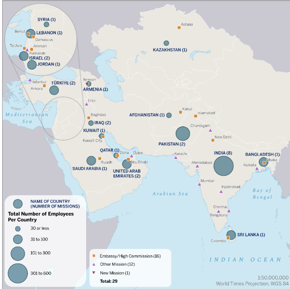
Map 5. Canada's Missions in Central Asia, South Asia and West Asia

Note: The Canadian Embassy in Afghanistan has temporarily suspended operations.