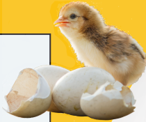
Table egg production in 2020 (million dozen)

In 2020, 77 licensed hatcheries produced a total of 819,755,602 birds , of which approximately 4% were used for table egg production.