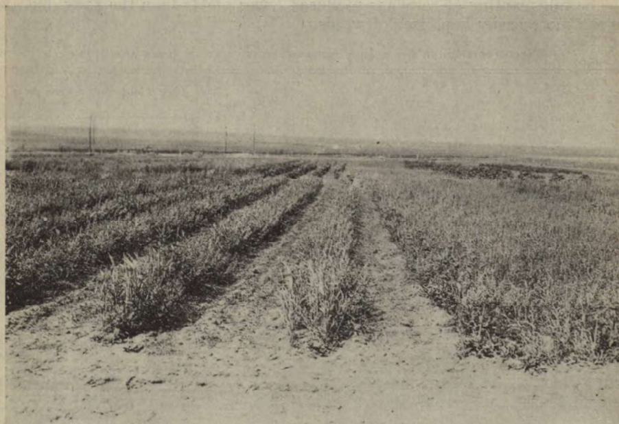
Oats and barley in rows as fallow substitutes, showing weeds in rows.

in these crops than in small grain crops in rows. With wheat, oats and barley in rows it has been found impossible to keep the rows reasonably free of weeds without hand hoeing. Since hand work of this sort is out of the question on crops of such low value, the failure to control weeds constitutes the greatest objection to small grain crops in rows as fallow substitutes. Moreover, wheat