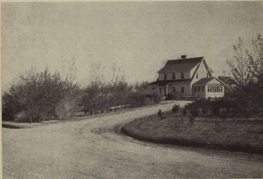
View of grounds showing five years' growth of trees and shrubs.

Published by Authority of the Hon. W. R. Motherwell, Minister of Agriculture, Ottawa, 1930