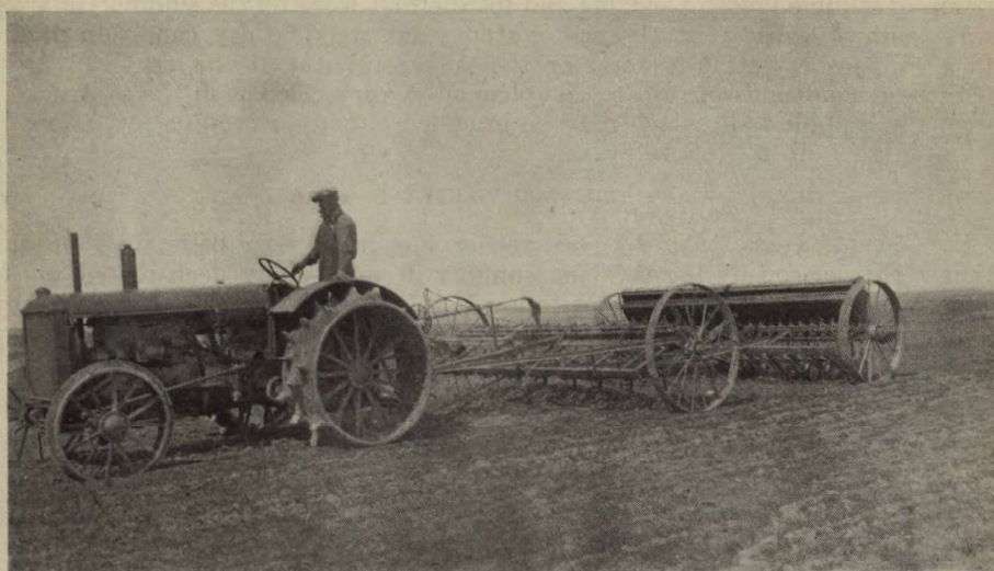
Cultivator and drill in combined hitch, preparing and seeding fallow at the rate of four acres per hour.