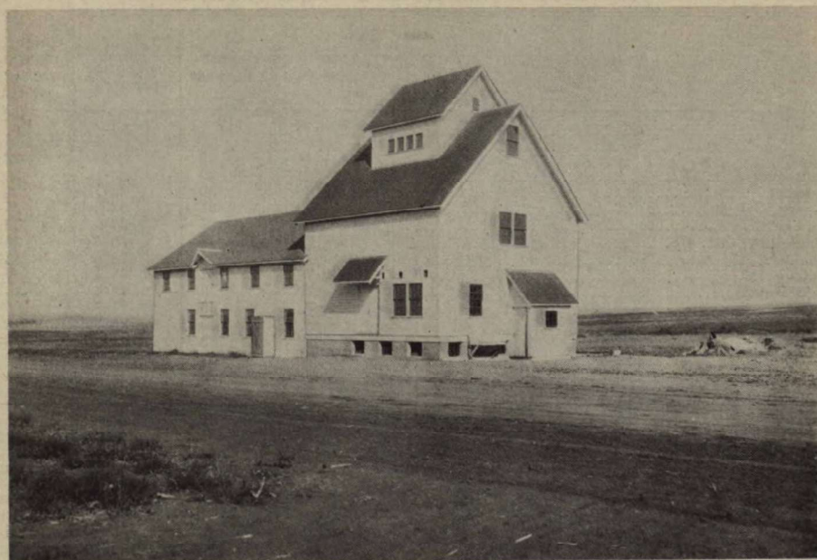
New seed storage and cleaning plant.