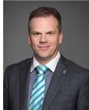
The Honourable Mark Holland MINISTER OF HEALTH

Once again, I express my thanks to all the stakeholders, community organizations, and individuals with lived and living experience of STBBI. Your contributions have made a lasting impact and will serve as a guiding force in our efforts to create a more inclusive, compassionate, and healthier future for all. I commend your resilience and look forward to working together.