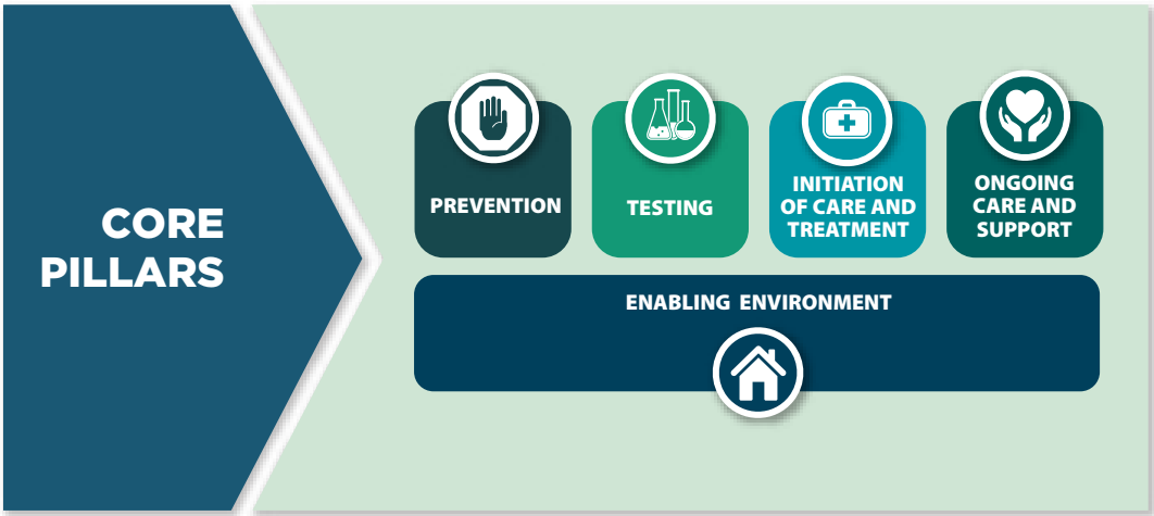
FIGURE 1. Pan-Canadian STBBI Framework for Action

Aligning with the Framework, this Action Plan focuses on key populations and four core pillars supported by the foundation of an enabling environment (Figure 1).