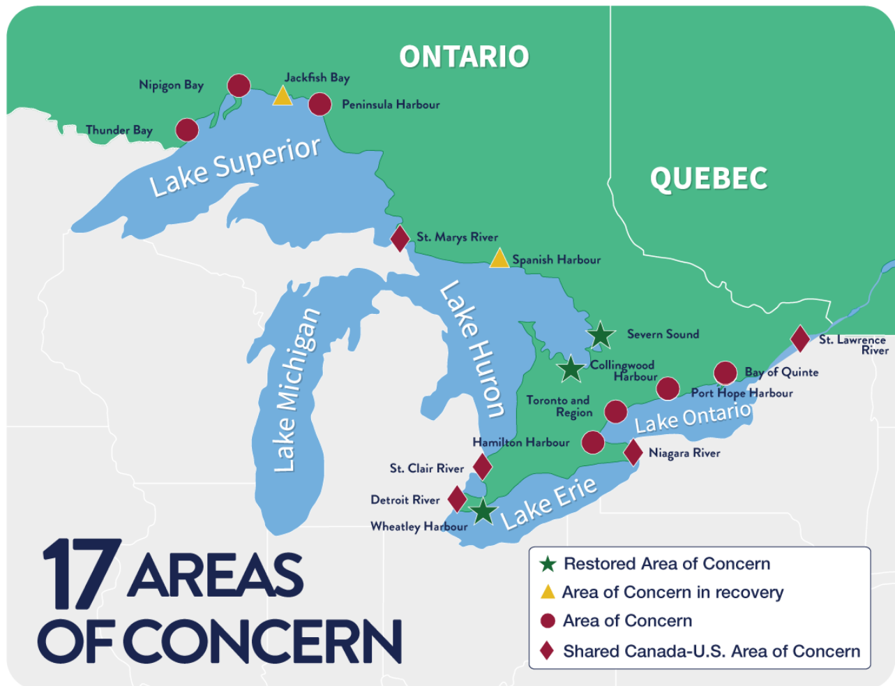
Figure 1. Status of Canada's 17 Great Lakes Areas of Concern, 2023