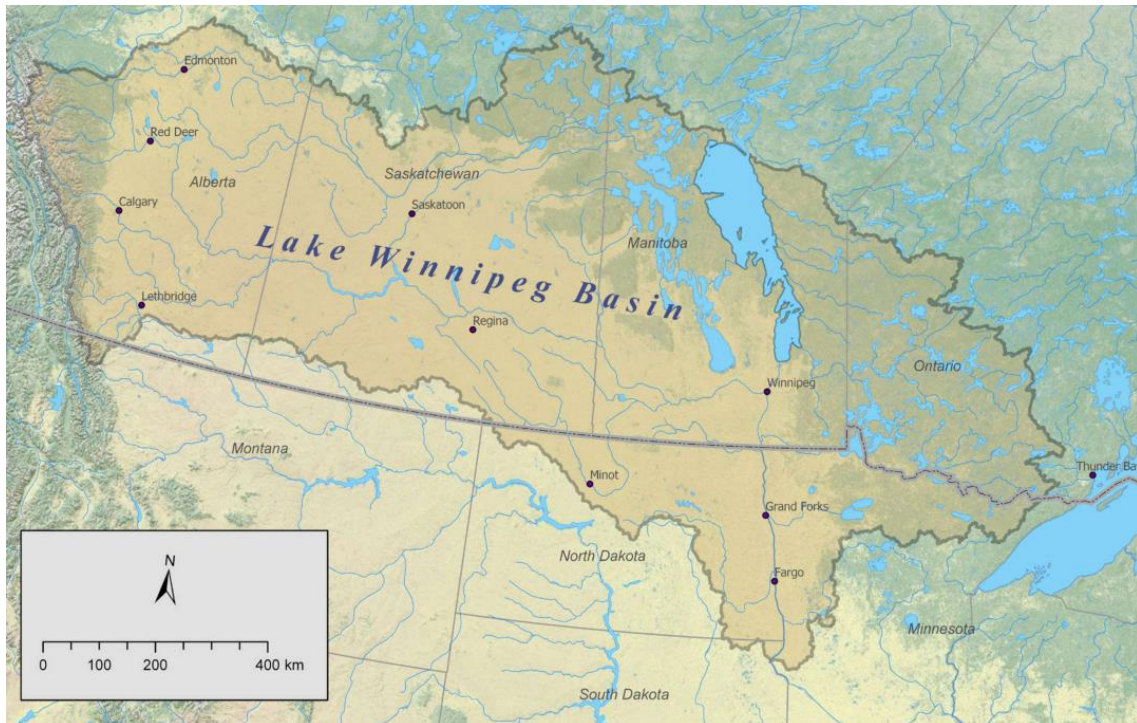
Figure 1. Drainage basin of Lake Winnipeg