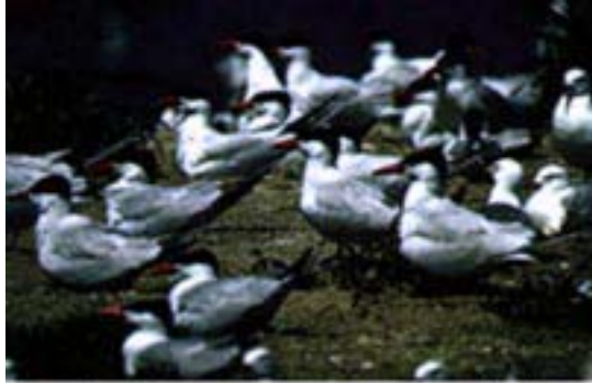
Caspian Tern colony on the Great Lakes