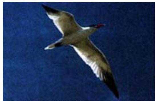
Caspian Tern in flight

done, not just here in their northern home, but nationally and internationally. Habitat loss is a pervasive threat. As an expression of its commitment to maintain biodiversity and conserve habitat, Environment Canada has forged partnerships with the governments of other countries, with provincial wildlife agencies, and with national and international non-government organizations. Terns are our shared natural heritage and as such are deserving of continued conservation efforts.