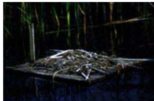
Douglas M. Guay

In the summer of 1990, park staff began a yearly census of adult Black Terns and documented a further 57 per cent decrease in the population from 1990 to 1992 (see Table 1). In 1993, Lake Ontario