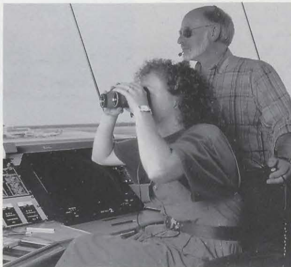
Air traffic control and instrument-landing systems

With the use of highly sophisticated and specialized computer systems, however, Communications Canada has been able to handle effectively an explosive growth in the number of licences issued. During the past 10 years the number has doubled, while the resources to handle the volume have decreased. At the