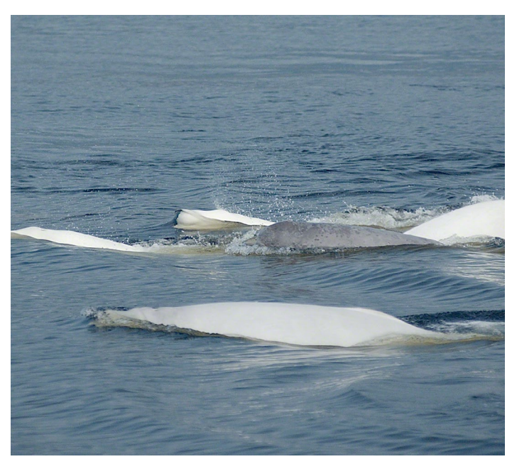
St. Lawrence Estuary Beluga ( Delphinapterus leucas ).