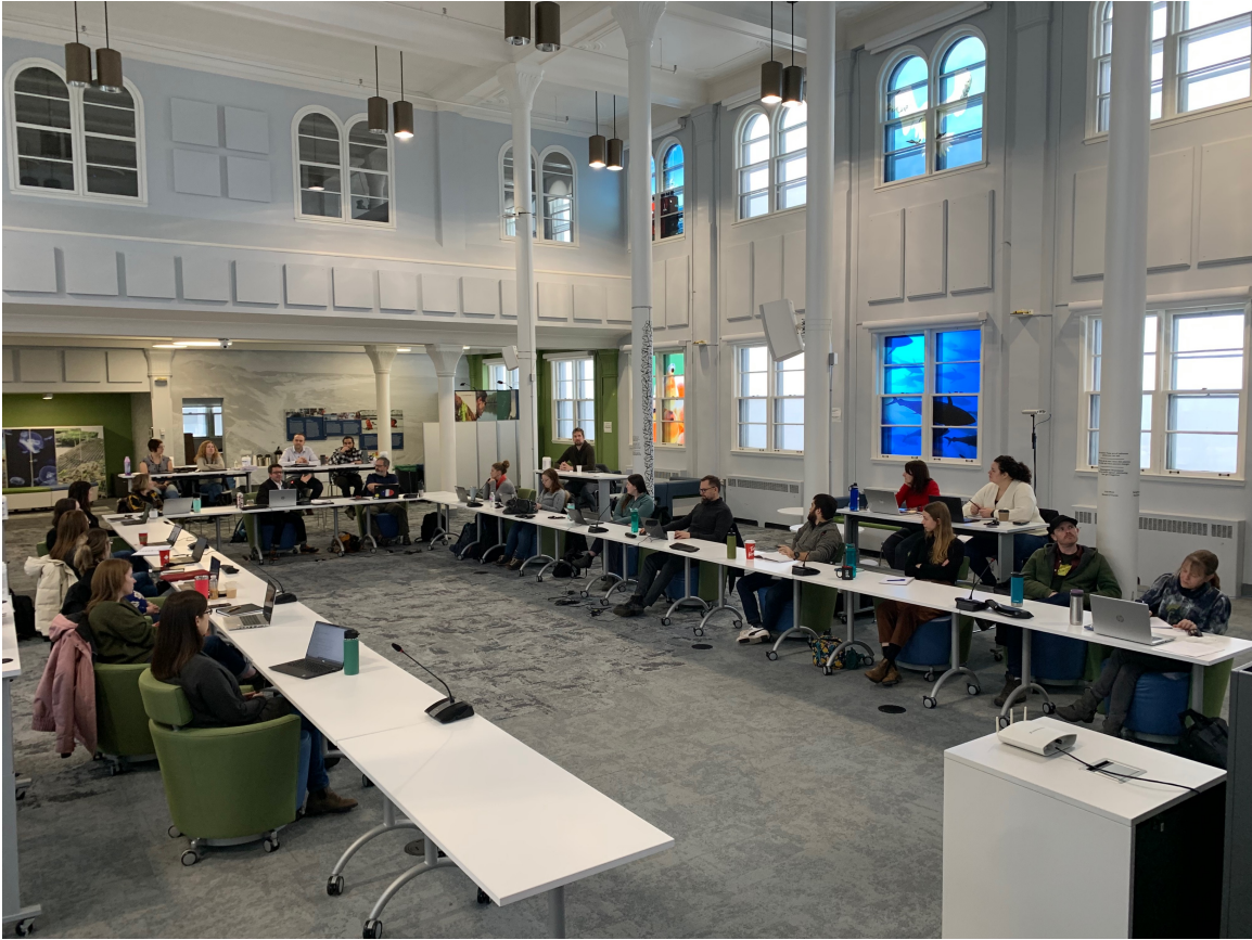
Figure 1. Day 1 of the TESA workshop “best practices in age estimation” held at the Atlantic Science Enterprise Center in Moncton, NB on 31 January, 01-02 February 2023.