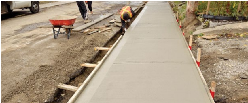
Stakes for concrete forms with marks at 29 cm

Municipal staff and their contractors should consider putting controls in place in situations where they are required to use stakes or pins, such as marking the 30 cm point on the stake or pin to visually confirm that it is not driven into the ground 30 cm or deeper. An example of where stakes or pins are used is the placement of building forms for concrete sidewalk replacements.