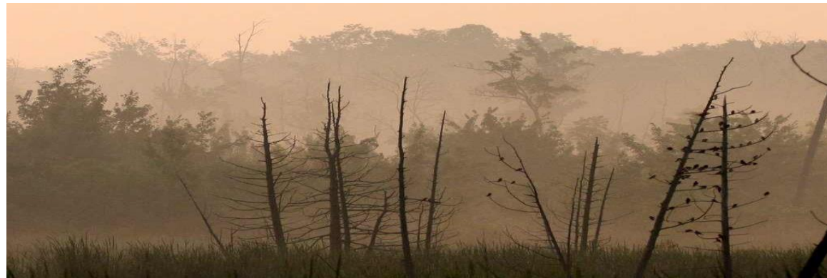
Smog from wildfires in Quebec, 2023

CSC is dedicated to the climate change related commitments set forth in Greening Government Strategy by evaluating energy consumption of institutions and implementing measures to reduce greenhouse gas emissions. Initiatives in this area contribute to the reduction of the severity and frequency of extreme temperatures and precipitation as well as wildfires, heatwaves, flooding and droughts. In addition, reducing GHG emissions will slow biodiversity loss in Canada and the negative health impacts on Canadians.