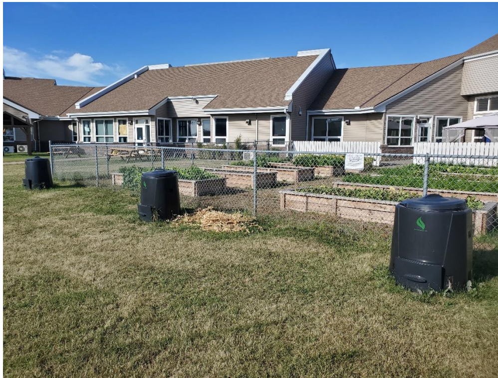
Edmonton Institution for Women, Alberta

Note: CSC performance indicators and targets have an end date of March 31 of the year indicated.