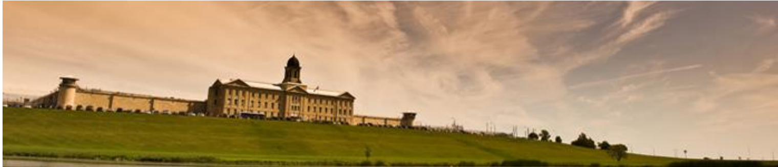
Stony Mountain Penitentiary, Manitoba