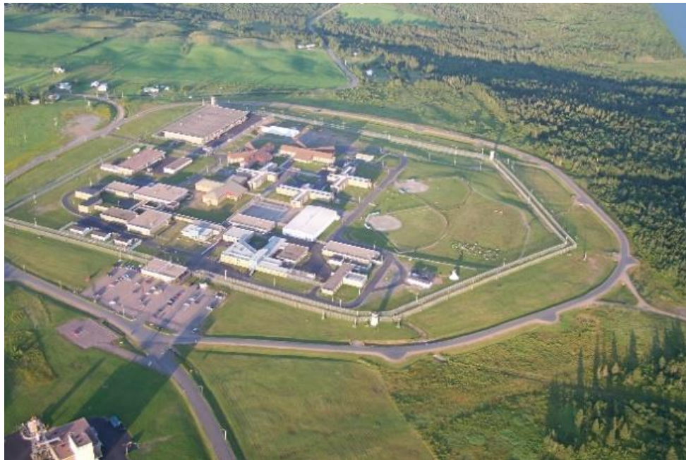
Springhill Institution aerial view, Nova Scotia

Please find more information on the FSDS public consultation and its results in the FSDS Consultation Report .