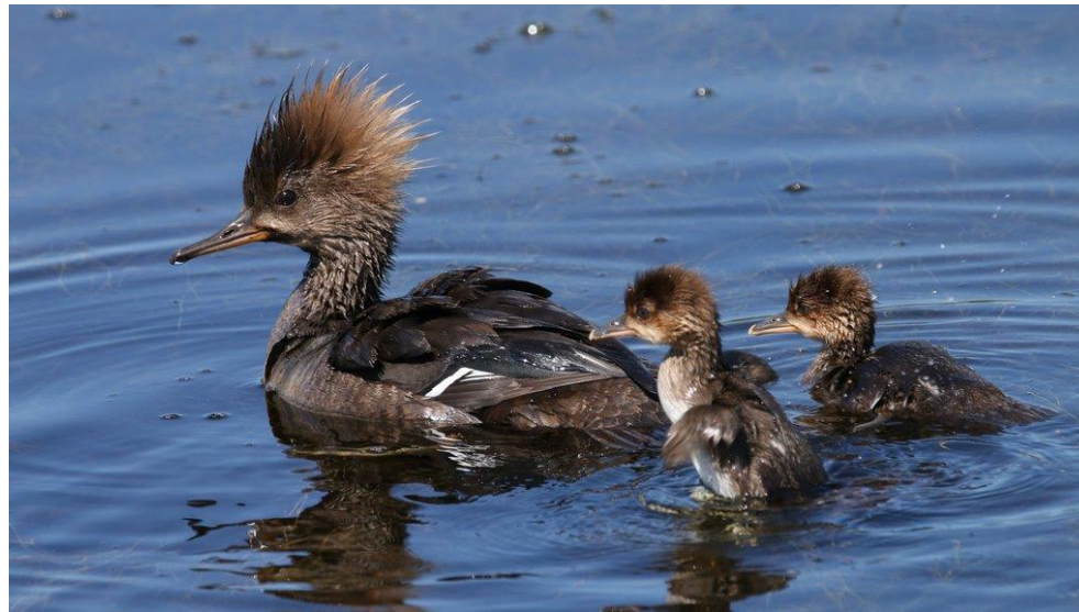
Family of ducks

CSC issues a Policy Bulletin every time a new or revised national policy instrument is promulgated. Its purpose is to introduce the policy change(s) and provide the rationale for the change(s). Currently, Policy Bulletins include information under key headings, such as "Why was the policy changed?", "What has changed?" and "How was it developed?". CSC will explore the potential for amending the current Policy Bulletin template to include information around the completion of a SEA. The introduction of such an approach will assist CSC in undertaking reflexive policy development that is continually aligned with environmental legislation and the department's Sustainable Development Strategy.