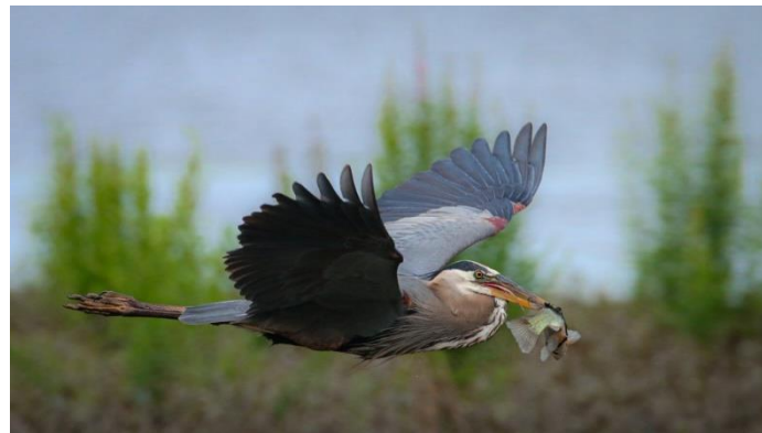
Heron with a fish

Hence, CSC will continue to make every effort to further demonstrate strong departmental leadership by managing its operations in an ecologically sound manner.