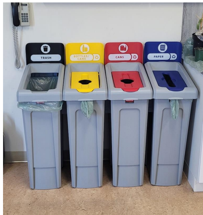
Institutional Waste Sorting Station