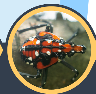
Late nymph stage July-September