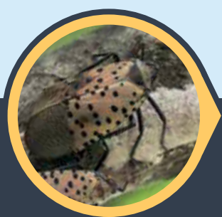
Egg laying September-November