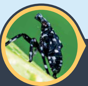
Early nymph stage May-July