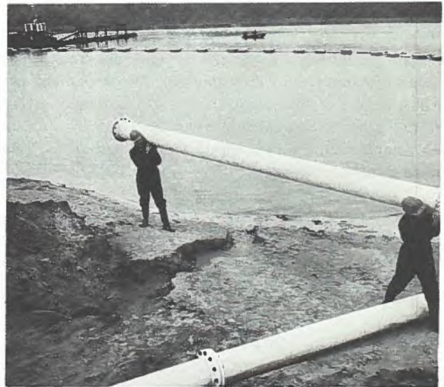
Centrifugal Casting Process for Large Pipes Procédé de moulage centrifuge pour gros tuyaux