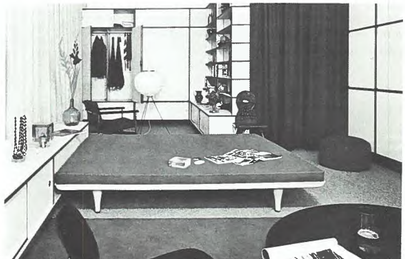
Knock-Down Furniture System