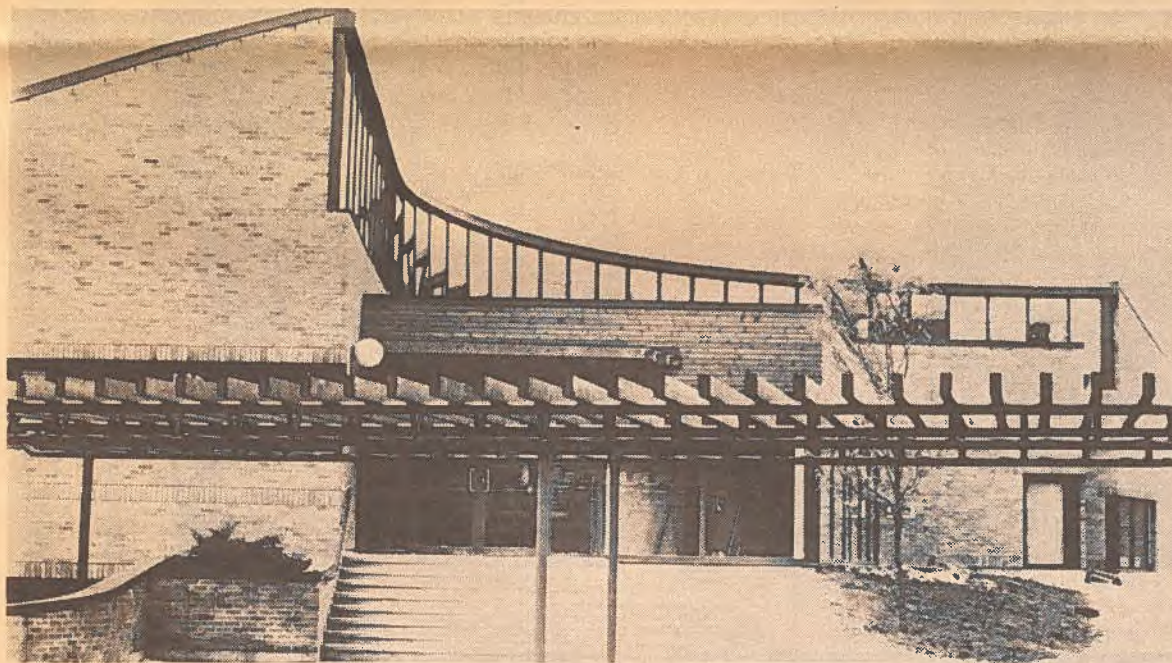
Peterborough's new library