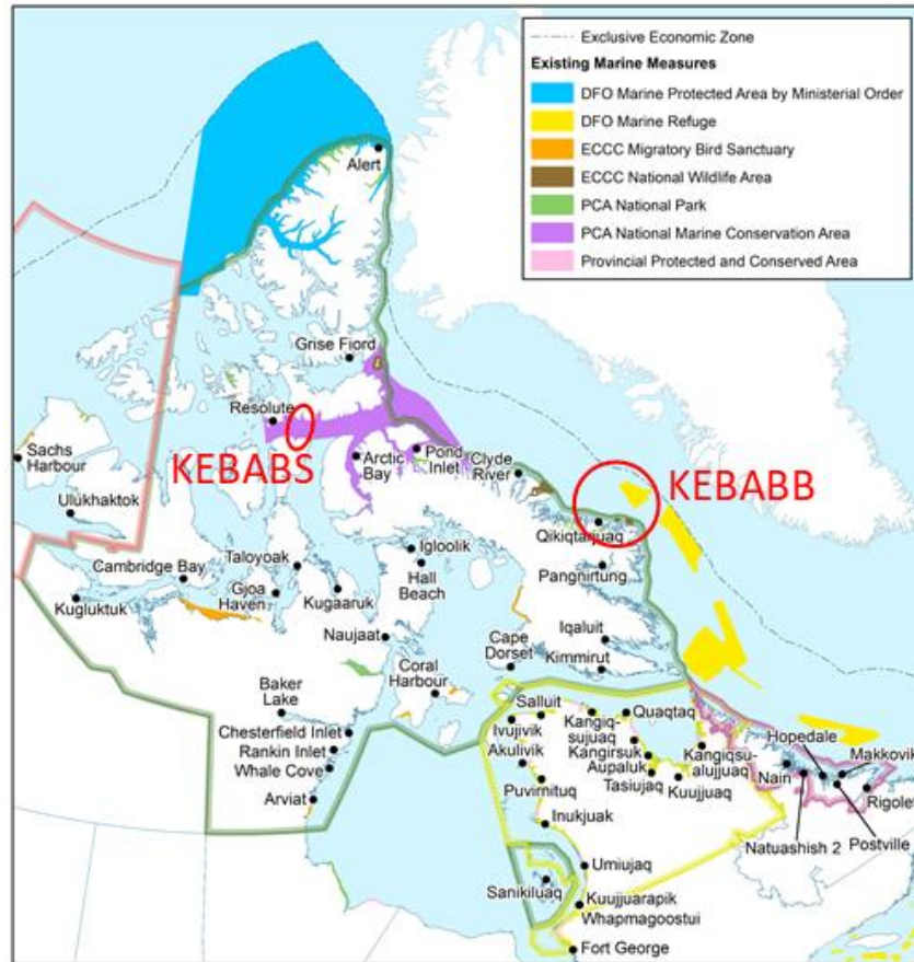
Figure 1. General sampling location of KEBABB and KEBABS programs in relation to existing marine measures.

fisheries potential as part of the Inuit Impact Benefit Agreement required to create the NMCA. The main objective for the KEBABS program in 2024 was to provide biogeochemical and oceanographic measurements along the historic sampling line established by DFO to inform and complement oceanographic moorings for ocean and sea ice conditions.