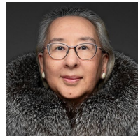
Nancy Karetak- Lindell